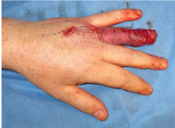
Figure 2. TPF flap inset and split skin graft.