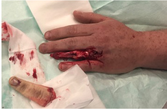
Figure 1. Initial presentation with Finger Avulsion Urbaniak III injury.

To date there are only two cases reported of temporoparietal fascial (TPF) flaps used for reconstruction of complete ring avulsion injuries, with the last being reported over 20 years ago. 3,4 In both cases, no specific parameters of functional outcome were reported. Hyperpigmentation of the reconstructed finger was reported. We report one such case, highlighting its merits as an excellent flap for reconstruction of ring avulsion injuries.